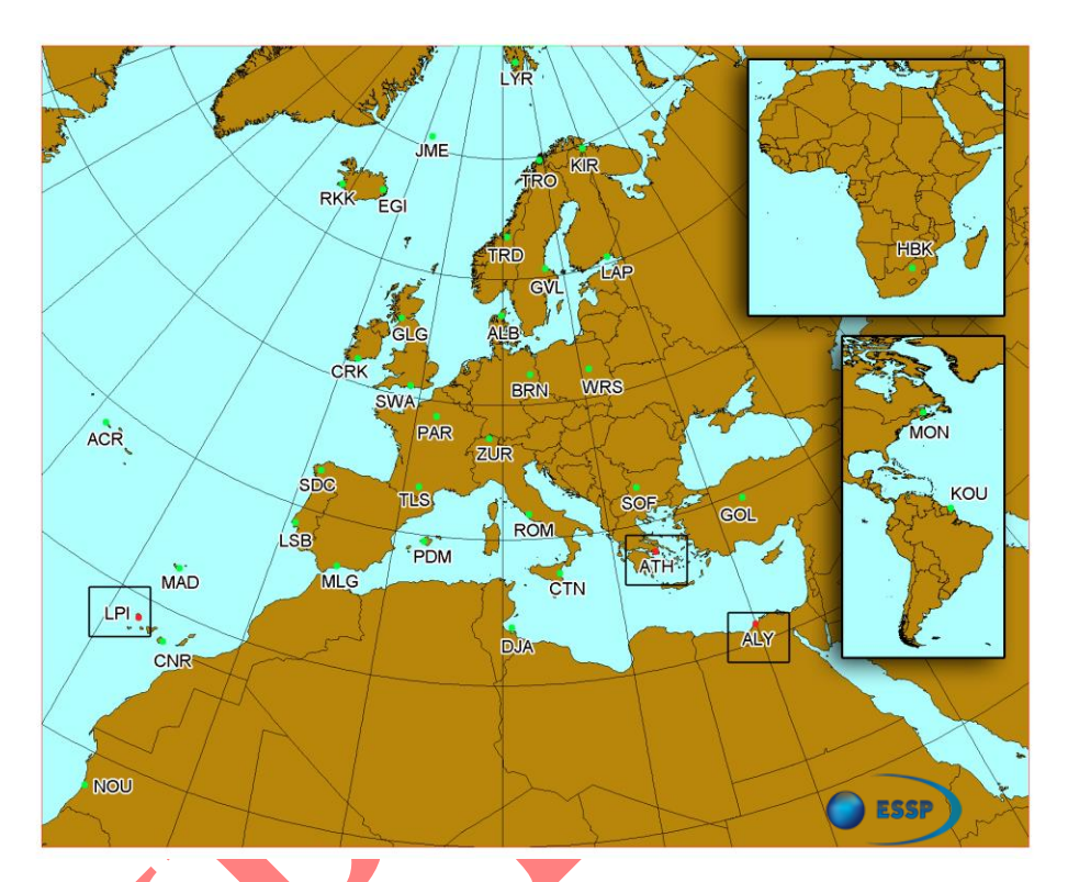
Figure 1 – EGNOS Reference Stations (3 new Reference Stations highlighted with a frame)