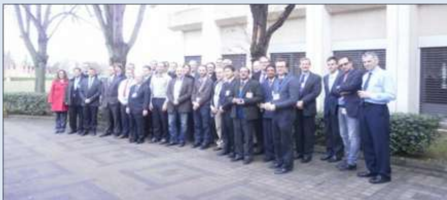
Participants at the 24 th IWG in Toulouse

Many other different activities under EGNOS, WAAS, GAGAN, SDCM and MSAS scope were presented at this meeting, which aim is to establish adequate cooperation/coordination among SBAS providers so their implementation becomes more effective and part of a seamless worldwide navigation system. The gathering was the first to be attended by Russia's space agency and the Indian Bureau of Civil Aviation, to discuss their own SBAS systems.