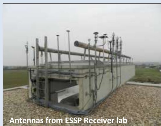
Antennas from ESSP Receiver lab

ESSP Receiver lab latest acquisitions have been Trimble (still under installation phase) and Topcon GR-1 receivers.